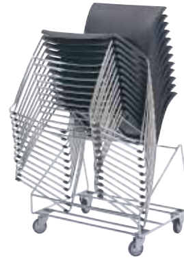
Stack chairs 30 high on optional dolly