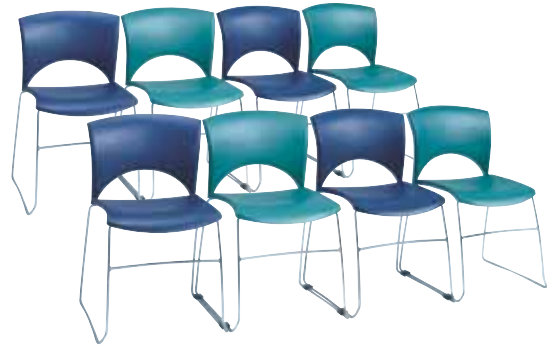
Chairs are ideal for overflow auditorium type seating