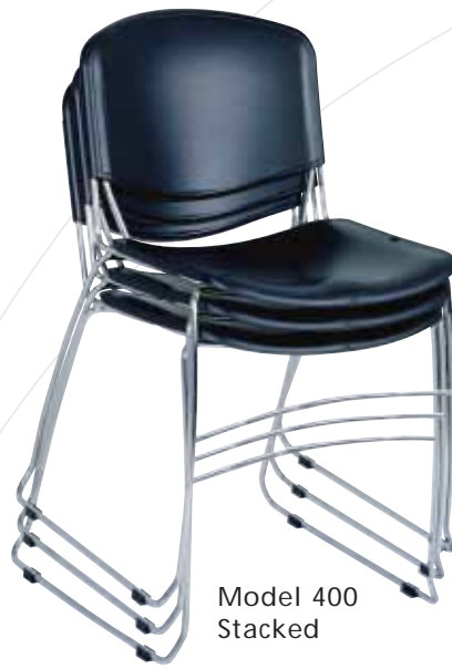
Model 400 Stacked