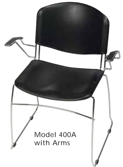
Model 400A with Arms