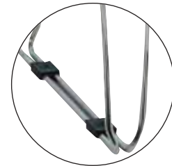
Ganging Connector Feet